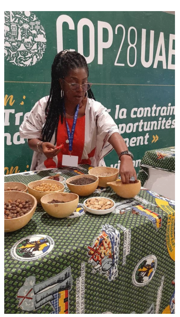
COP 28 Dubai