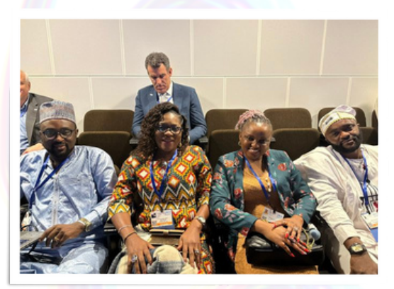
(a & b) INC-2 Paris